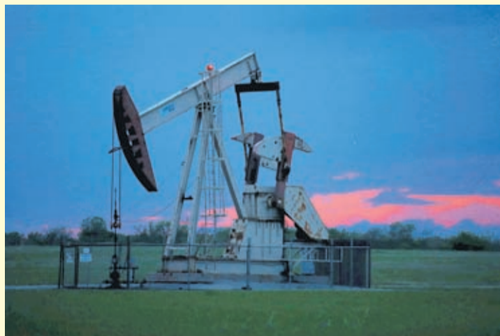
In this April 21, 2020 file photo, a pumpjack is pictured as the sun sets in Oklahoma City.

Google says it will no longer build custom artificial intelligence tools for speeding up oil and gas extraction, separating itself from cloud computing rivals Microsoft and Amazon. The announcement followed a Greenpeace report Tuesday that documents how the three tech giants are using AI and computing power to help oil companies find and access oil and gas deposits in the U.S. and around the world. The environmentalist group says Amazon, Microsoft and Google